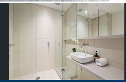
201/1 Dyer Street Richmond VIC