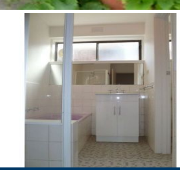
1/7 Bayview Street Northcote VIC