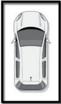
CARSPACE (NOT IN POSITION)