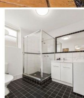
5/70 Collins Street Thornbury VIC