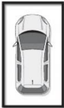
CARSPACE (NOT IN POSITION)